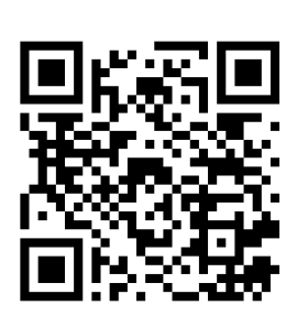
for \ monthly \ real \ estate \ content